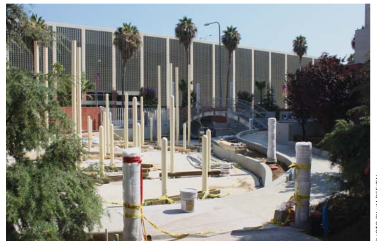
The outdoor spaces of the New Hospital Building are coming together. This portion of the Jane Vruwink Palmer Healing and Play Garden will feature the boundless play area created by Shane's Inspiration.