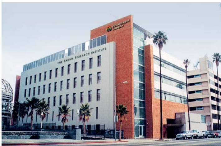
The Saban Research Building, dedicated in 2003

Construction continues on the New Hospital Building at 4650 Sunset Boulevard. Scheduled to be complete in 2010, the 317-bed, 460,000-square-foot facility is situated across the street from The Saban Research Building, one of the nation's premier scientific environments, made possible by a $40 million gift from Cheryl Saban, PhD, and Haim Saban, the largest individual donors in Childrens Hospital's history.