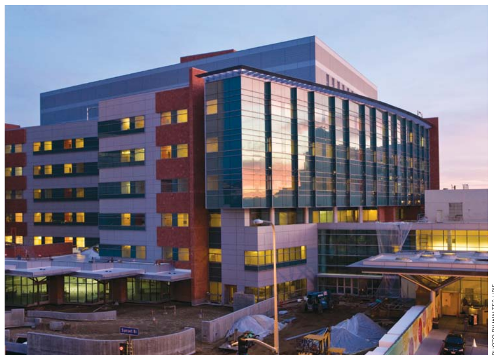
The New Hospital Building at Childrens Hospital Los Angeles

"The Grand Opening of the New Hospital Building at Childrens Hospital in Summer 2011 promises to be one of