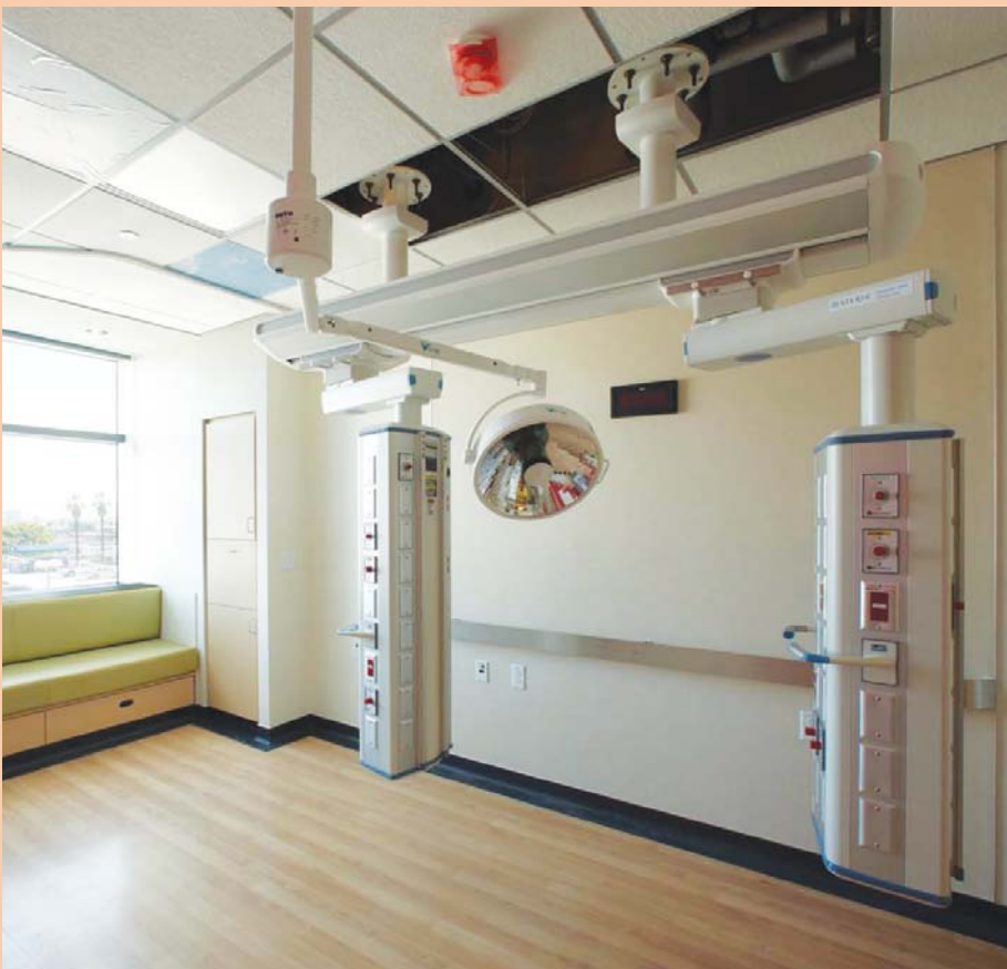
A private patient room in the CTICU of the New Hospital Building. Surgical “booms” allow for emergency bedside procedures if necessary.

All patient rooms within the Heart Institute will feature a pullout bed, allowing parents to stay overnight even in the intensive care units. To further incorporate family-centered care, the Institute will house a Chase Place playroom staffed with child life specialists who offer therapeutic play in a nurturing environment, as well as a restful family lounge. ●