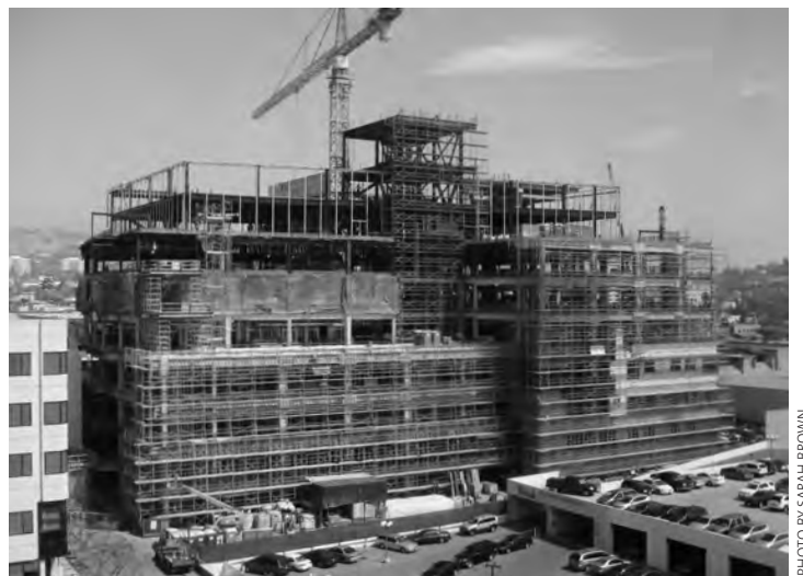
March 19, 2008