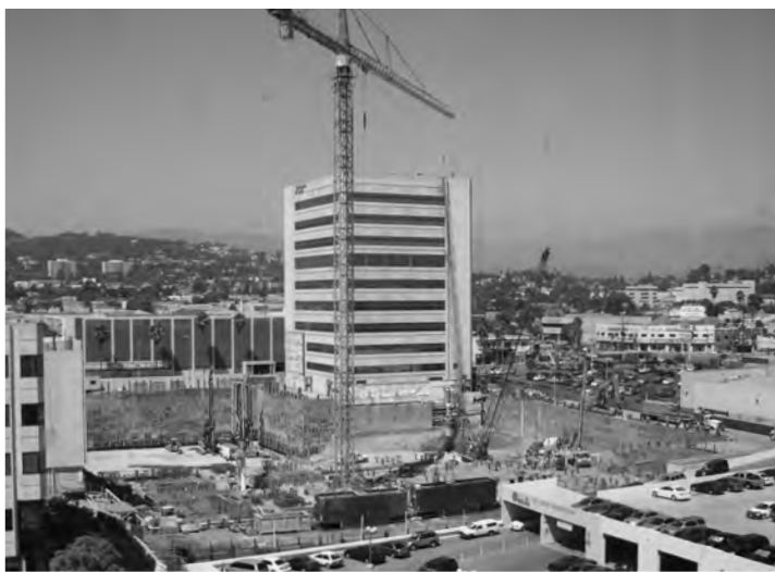
August 24, 2006

The New Hospital Building continues to rise at 4650 Sunset Boulevard. The 317-bed, 460,000 square foot medical facility is scheduled to open in 2010.