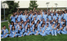
Camp CHLA Graduates

Outreach to local high school and college students, and foster youth to learn about careers in health is an important part of CHLA's commitment to enhance youth and build a future workforce reflective of our community. These programs include career day visits to local schools by our physicians, nurses and allied health providers, youth mentoring, volunteer work, job shadowing in hospital departments, internships for high school and college students in nursing, social work, health policy, science and research.