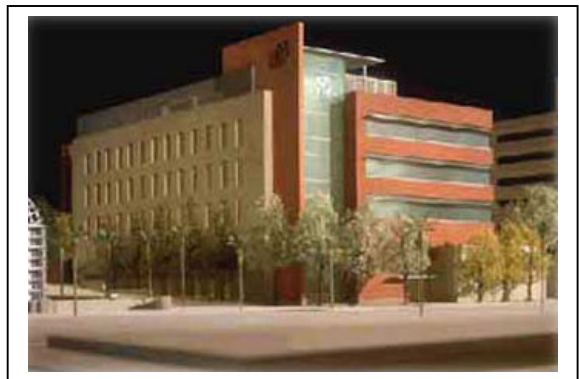
The Saban Research Institute of Childrens Hospital Los Angeles