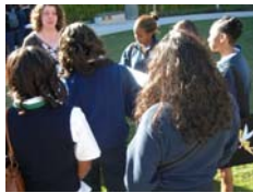
St. Mary's Academy Job Shadow Day

To promote literacy and appreciation for the arts, programs such as Reach Out and Read, the Saban Story Corner Volunteer Reading Programs, Poetry, music and opera programs through the Johnny Mercer/Mark Taper Arts Program are offered in conjunction with community partners. Therapeutic Library services are also made available. Programs such as Dream Ventures provide opportunities for community youth with chronic illnesses.