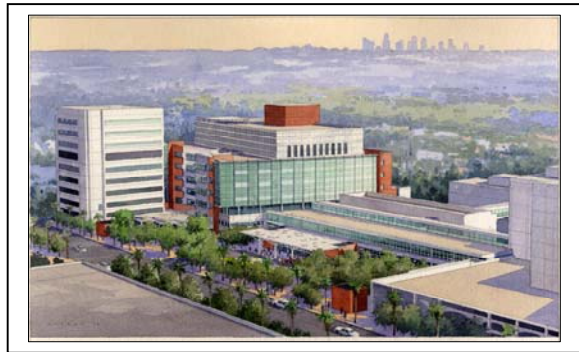
Childrens Hospital Los Angeles

Workforce investment and literacy programs and community recruitment for employment.