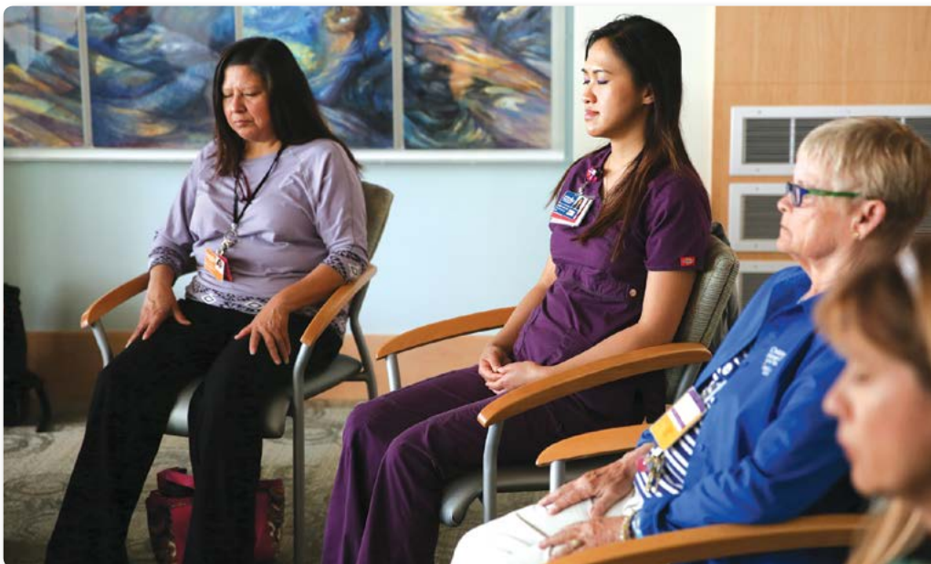
Meditation class at the Interfaith Center