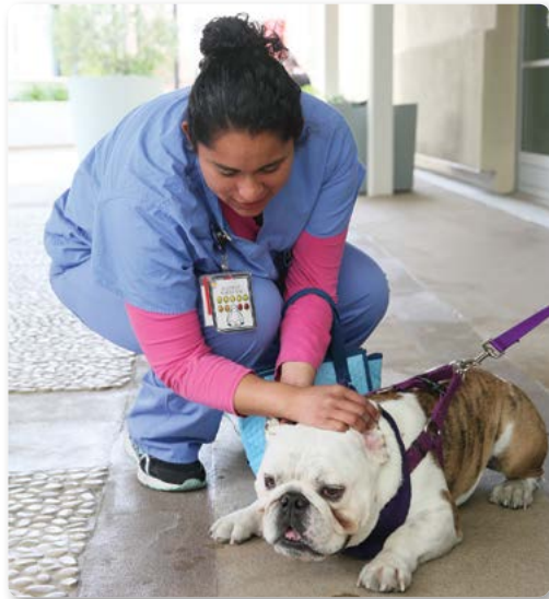
Dog therapy class with Brinks the bulldog

Best part of being a grandmother: Re-exploring life and the world around me through their eyes